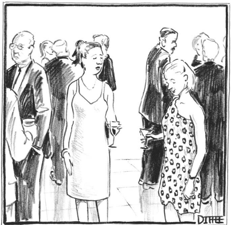
“Thanks. It’s vintage.”