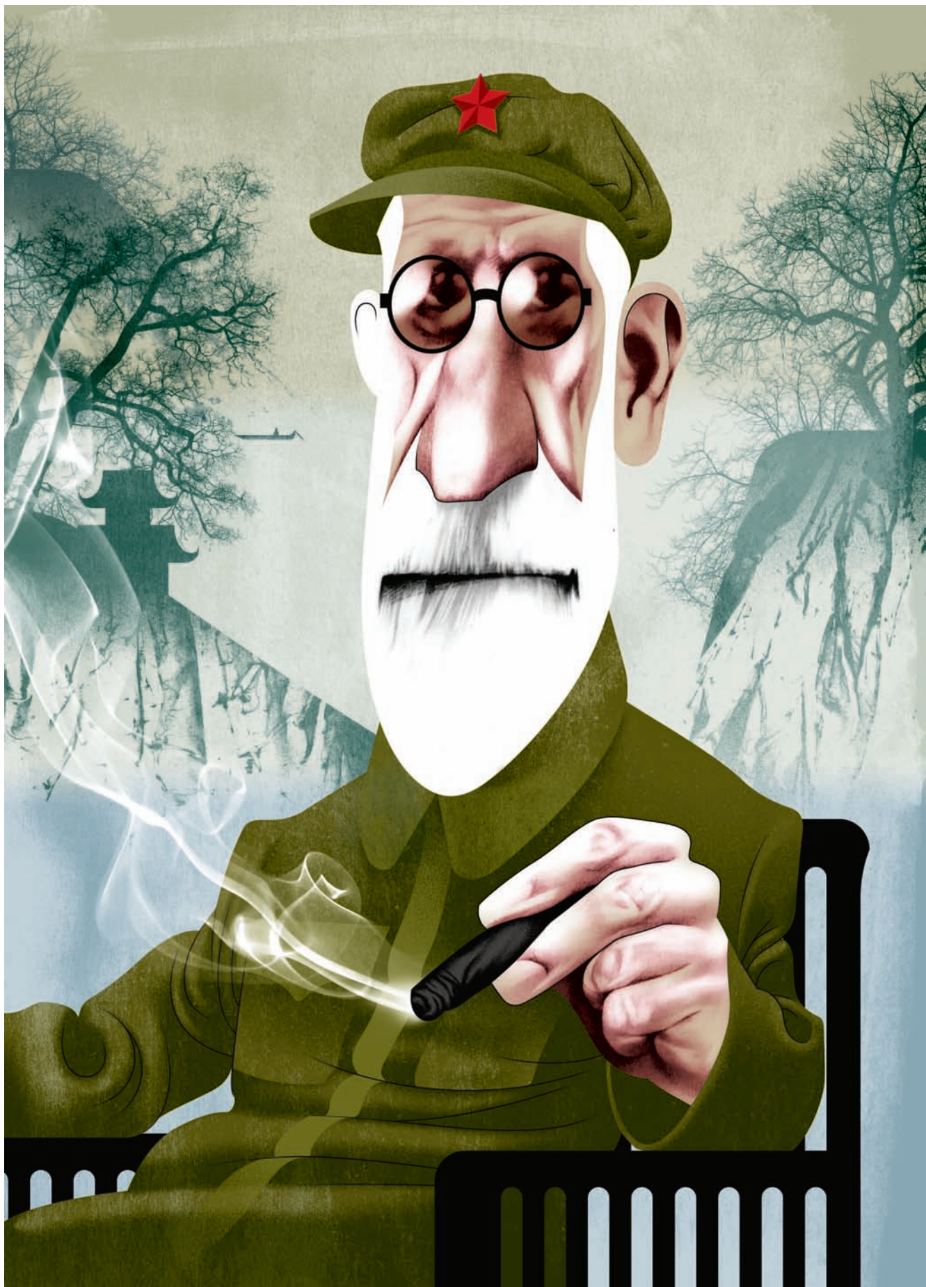
Video consultations are popular, but some question whether China should bother with a therapy that the West has largely discarded.